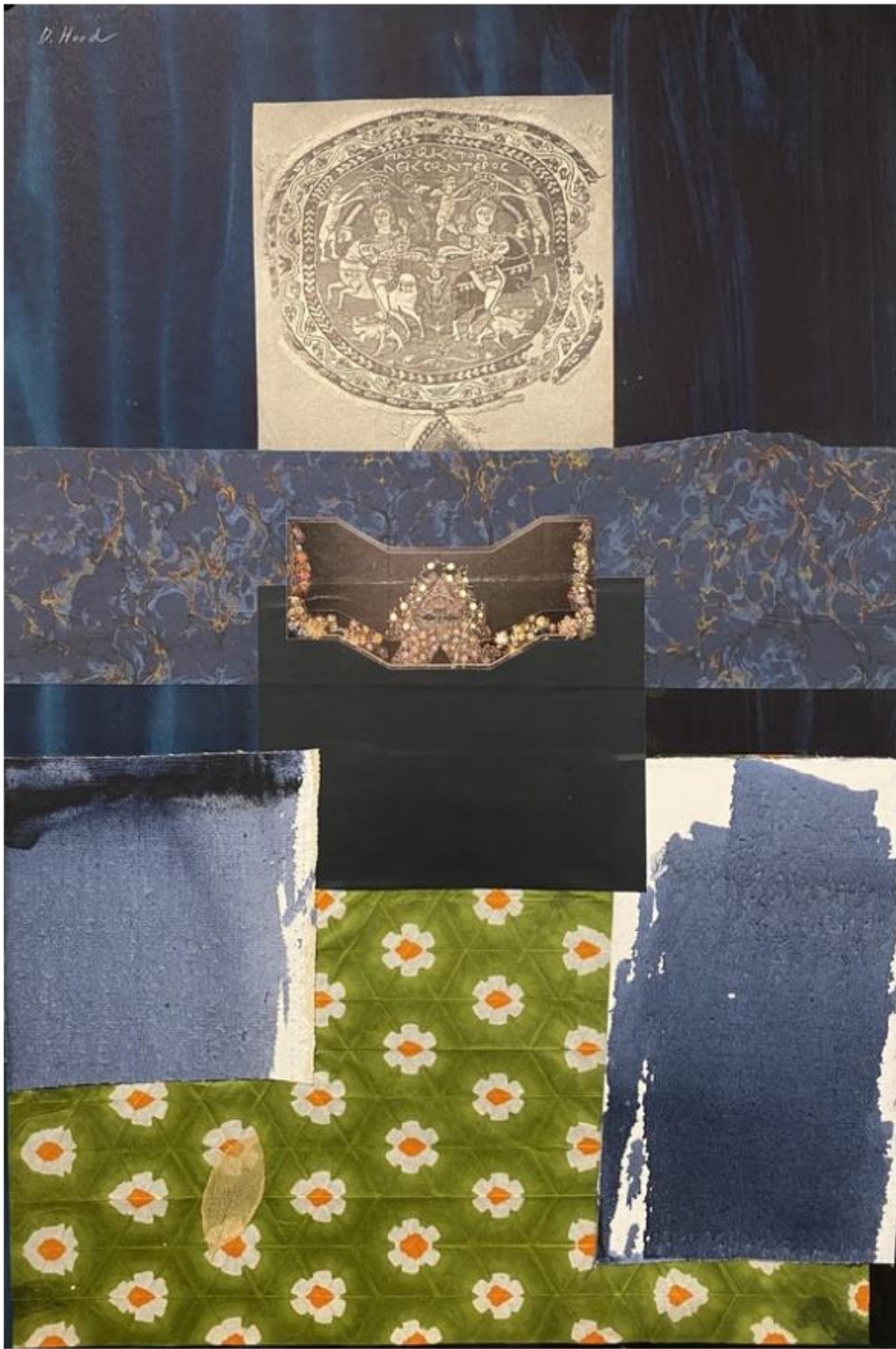
Dorothy Hood, Coptic Days , ca. 1980, 30 x 20 inches, Public Art of the University of Houston System, mixed media